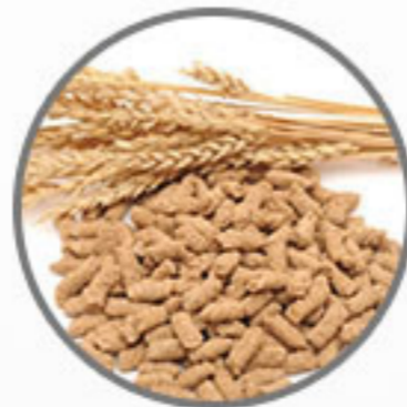
Wheat Extract (Placenta)