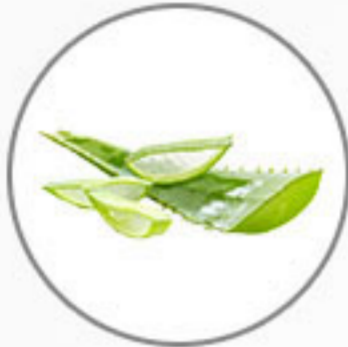
Aloe Vera Gel