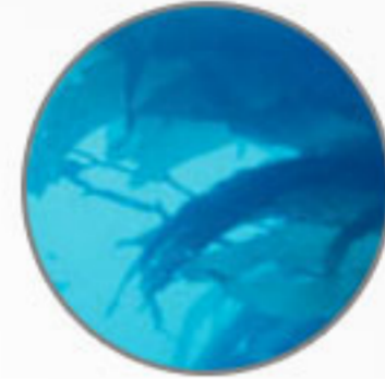
Soluble Collagen (Marine)